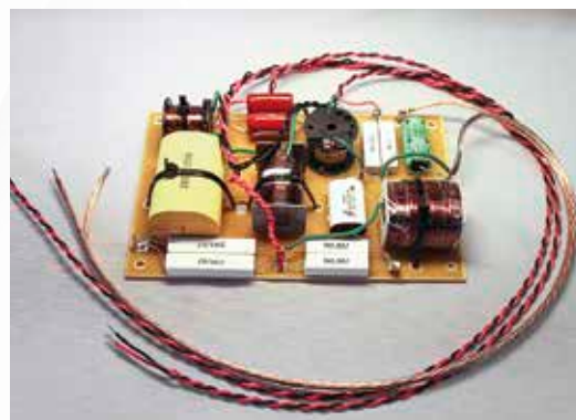
▲ Low-inductance twisted cables and high-quality - but not exotic - components characterize the Audes crossover

In a direct comparison, it's clear why the Audes is twice the price of the Canton: the Estonian speaker is always stays a touch on the warm side and its pronounced musicality - as well as its timing - is likely to make the brand even more popular.